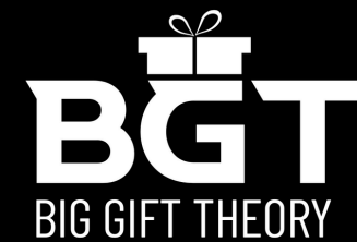
Big Gift Theory