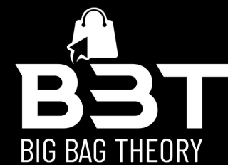
Big Bag Theory