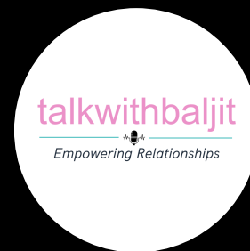
Talk with Baljit